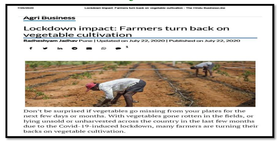
Plate.1 Article published in The Hindu Business Line regarding 'Lockdown Impact: Farmers turn back on vegetable cultivation'